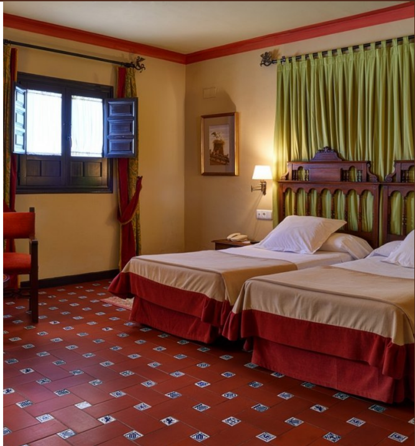
Parador de Úbeda Rooms