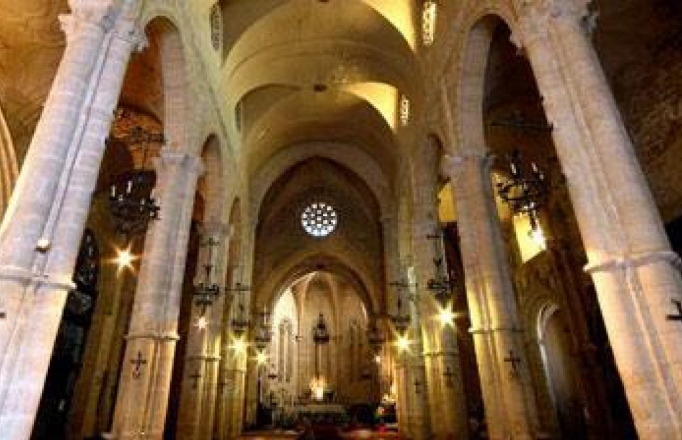
Parador de Úbeda Surroundings