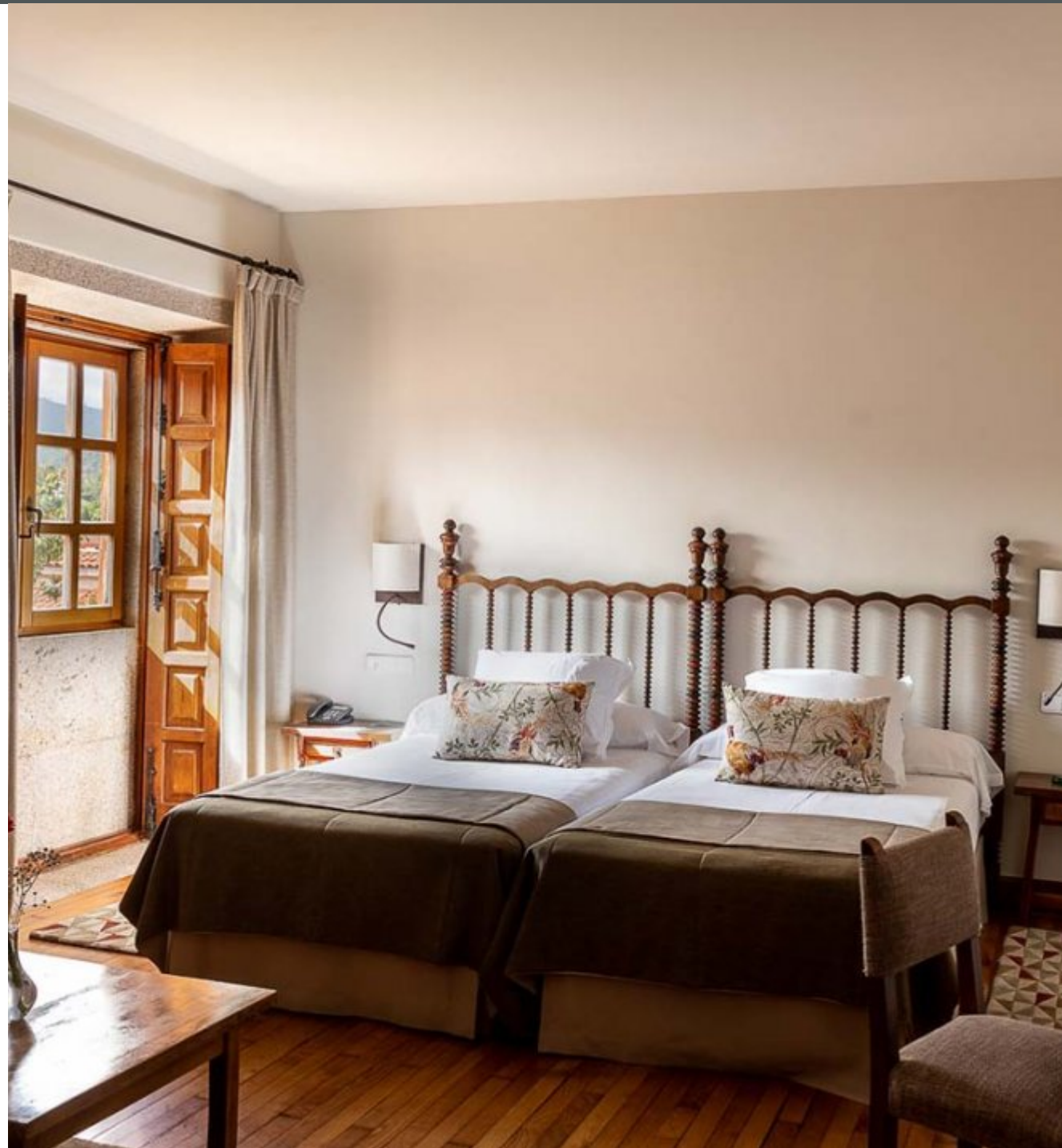
Parador de Tui Rooms