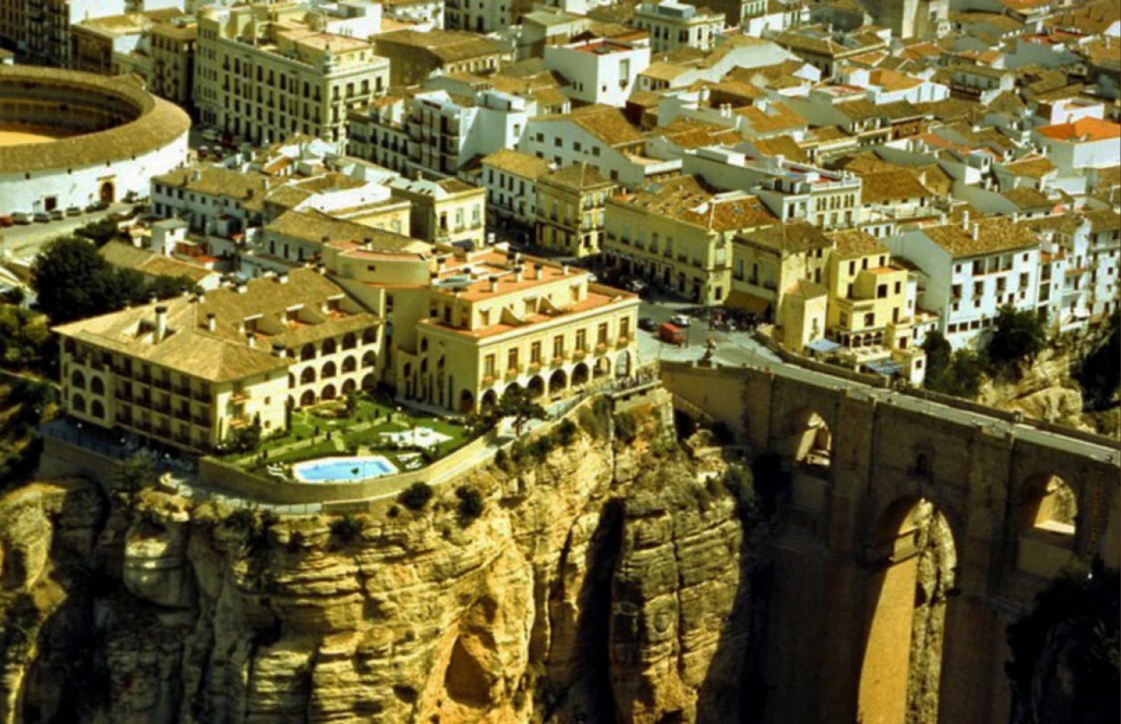
Parador de Ronda Surroundings