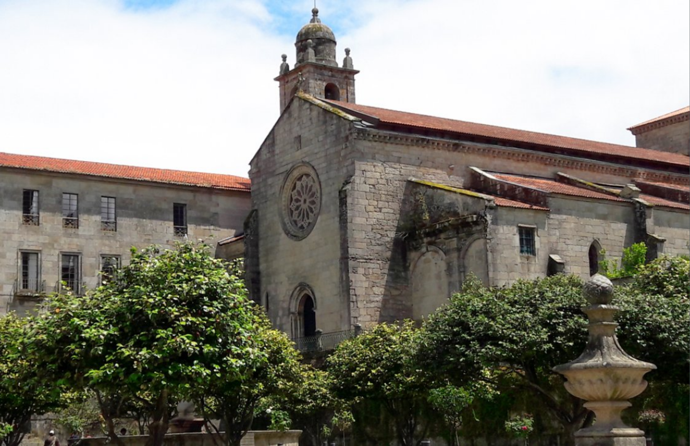
Parador de Pontevedra Surroundings