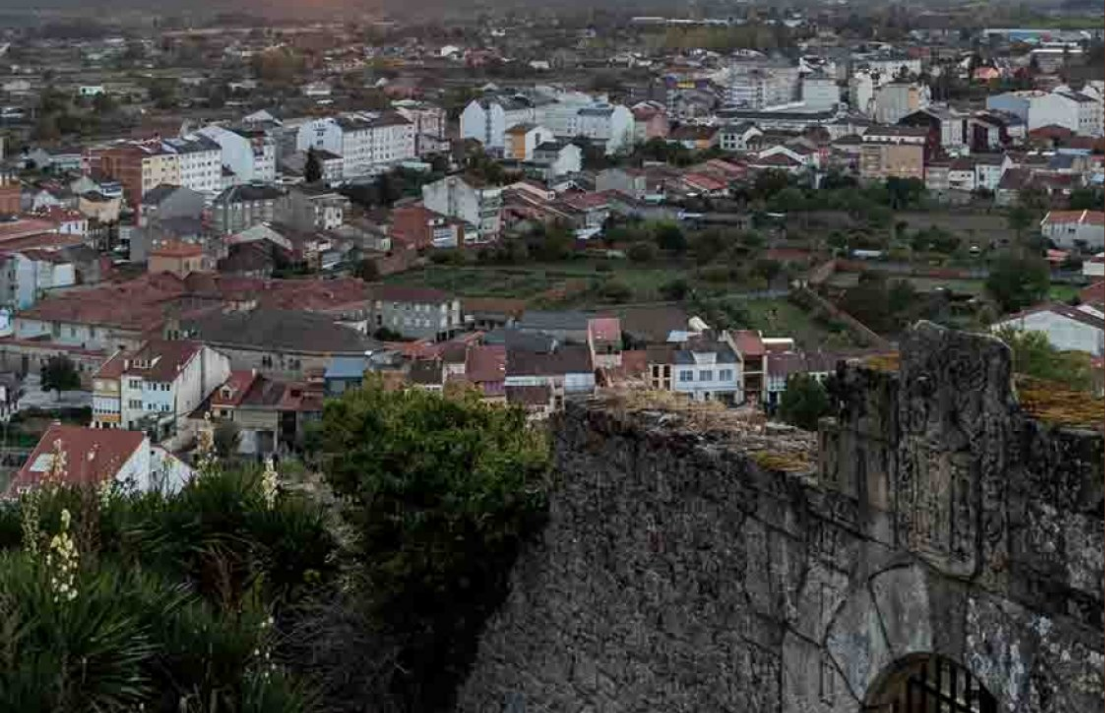
Parador de Monforte de Lemos Surroundings