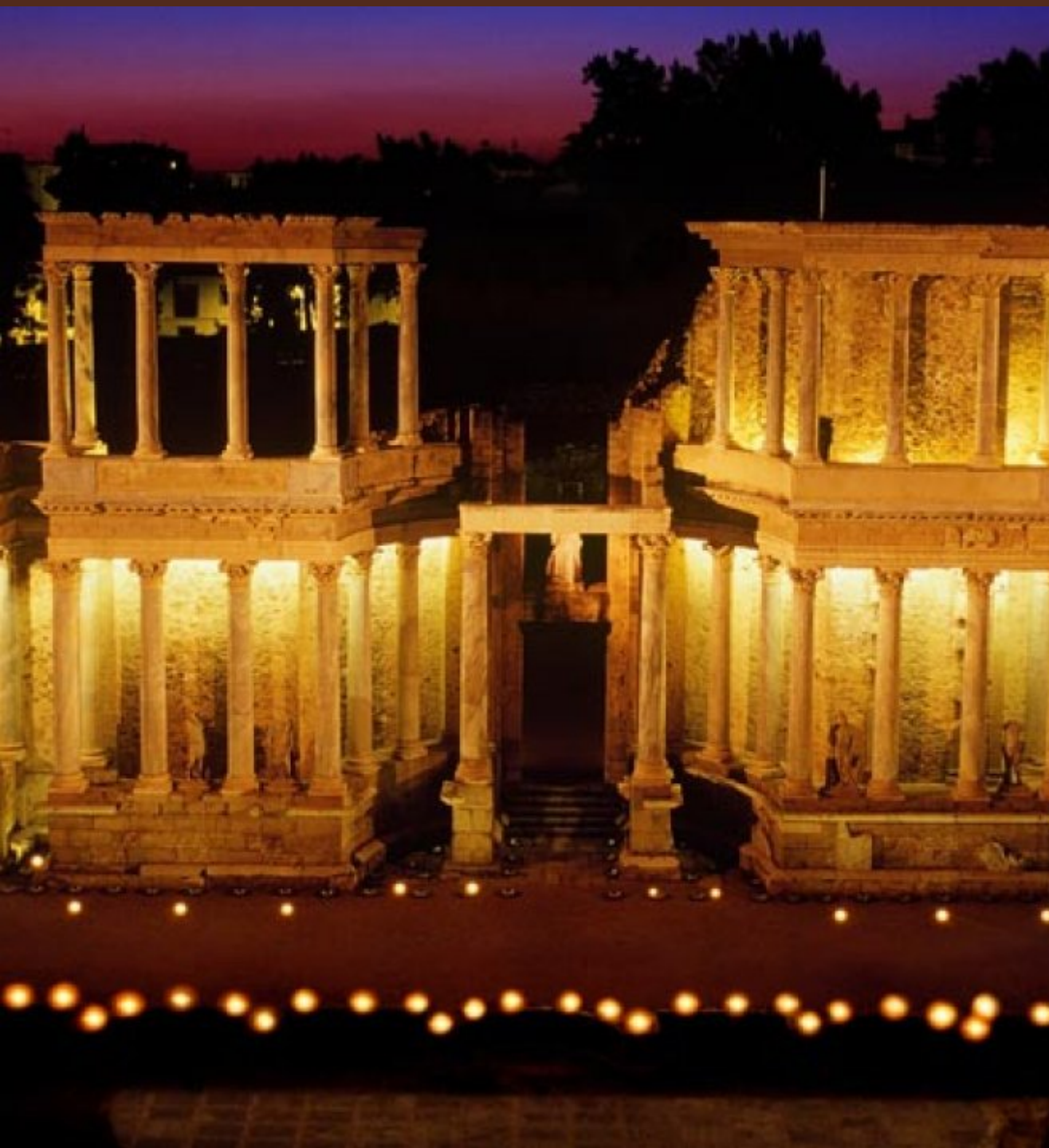
Parador de Mérida Surroundings