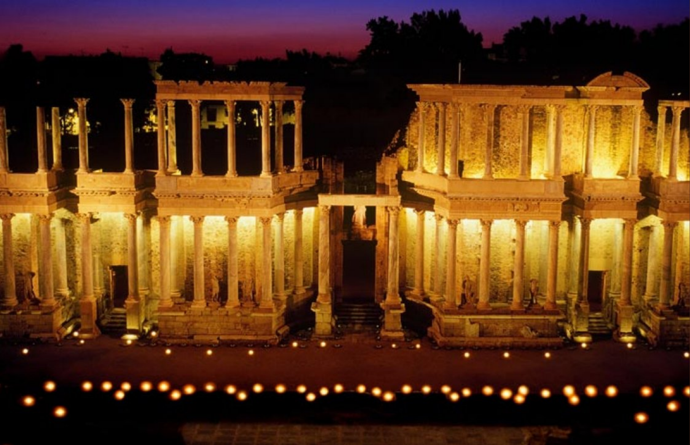
Parador de Mérida Surroundings