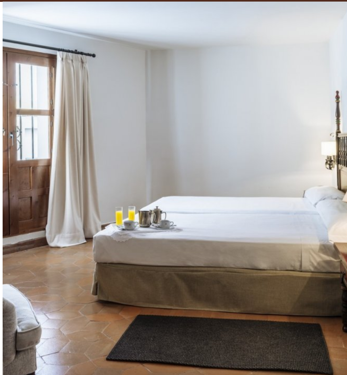
Parador de Mérida Rooms