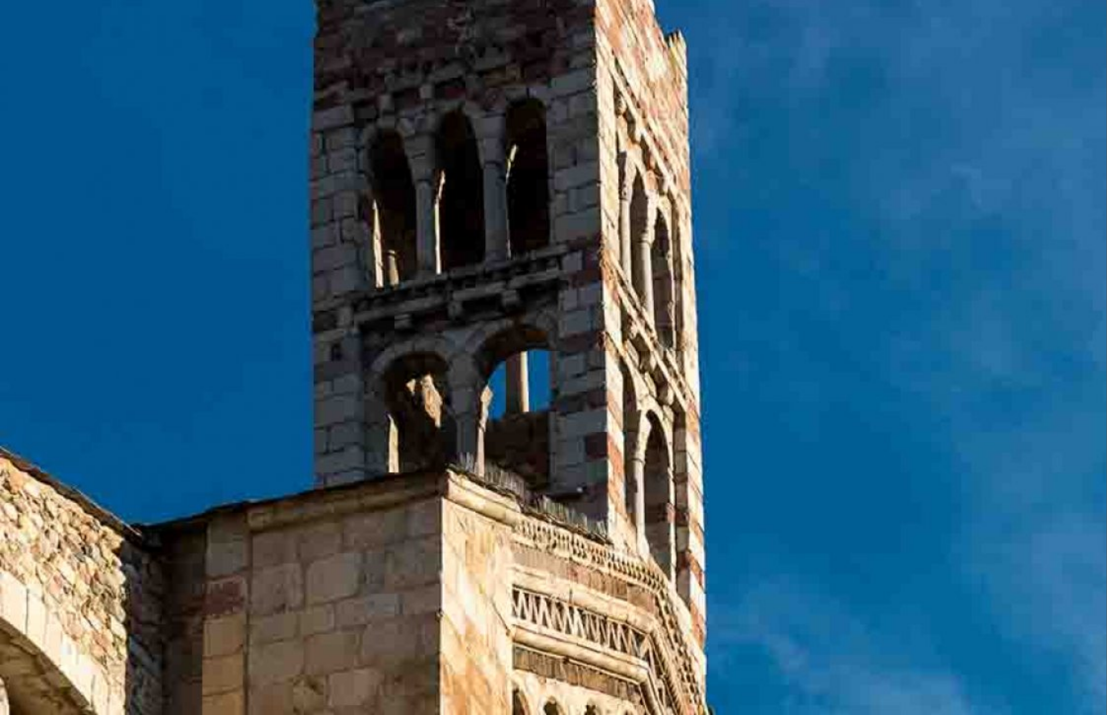
Parador de La Seu d'Urgell Surroundings