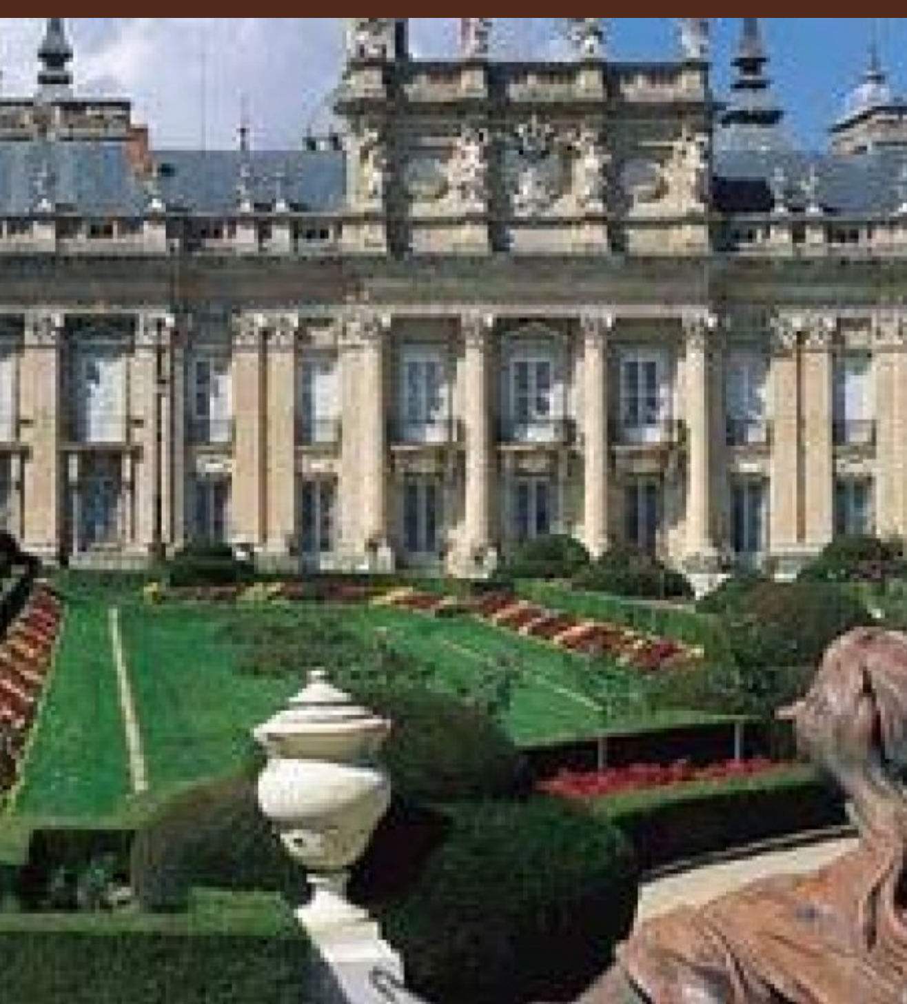
Parador de La Granja Surroundings