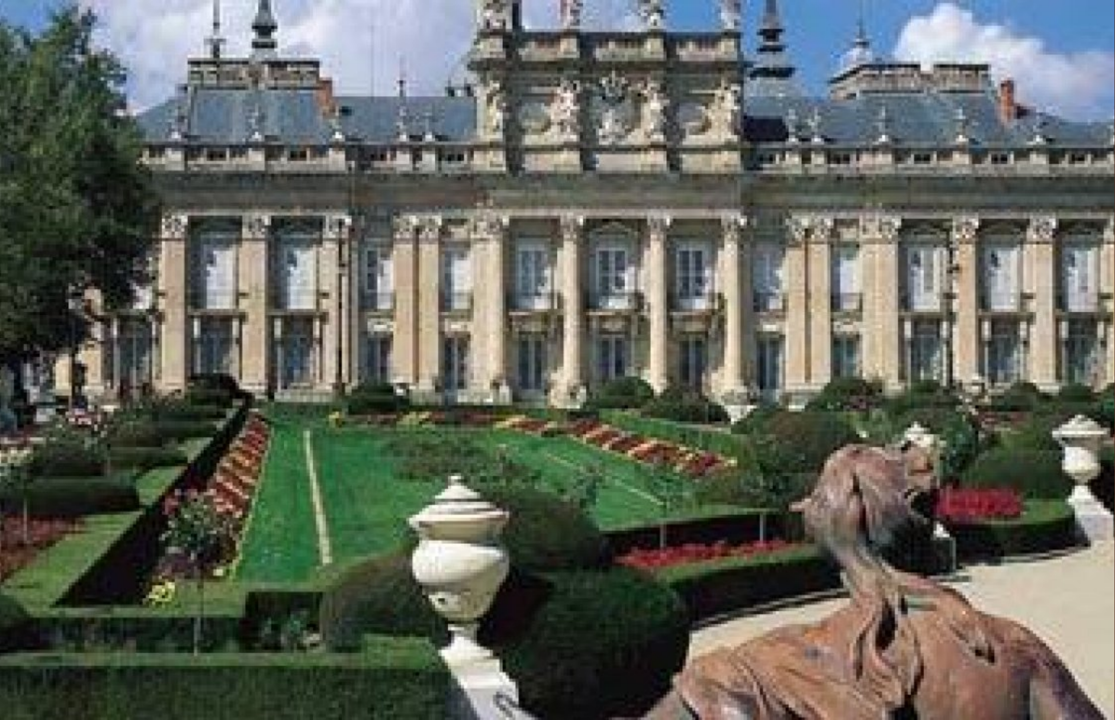
Parador de La Granja Surroundings