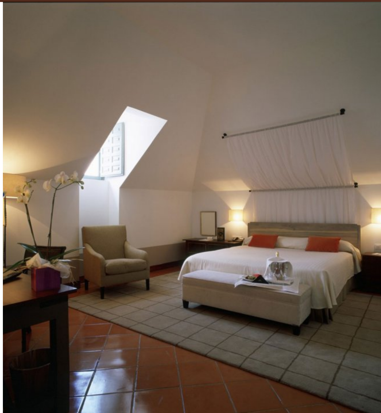
Parador de La Granja Rooms