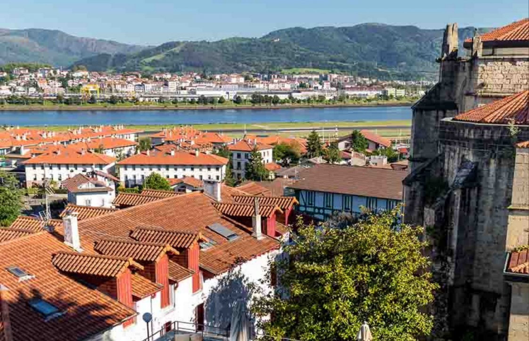
Parador de Hondarribia Surroundings