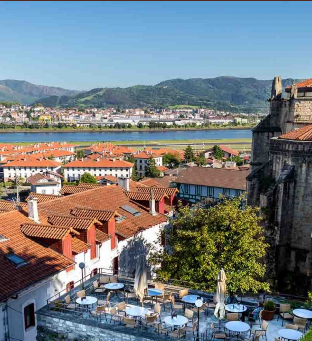
Parador de Hondarribia Surroundings