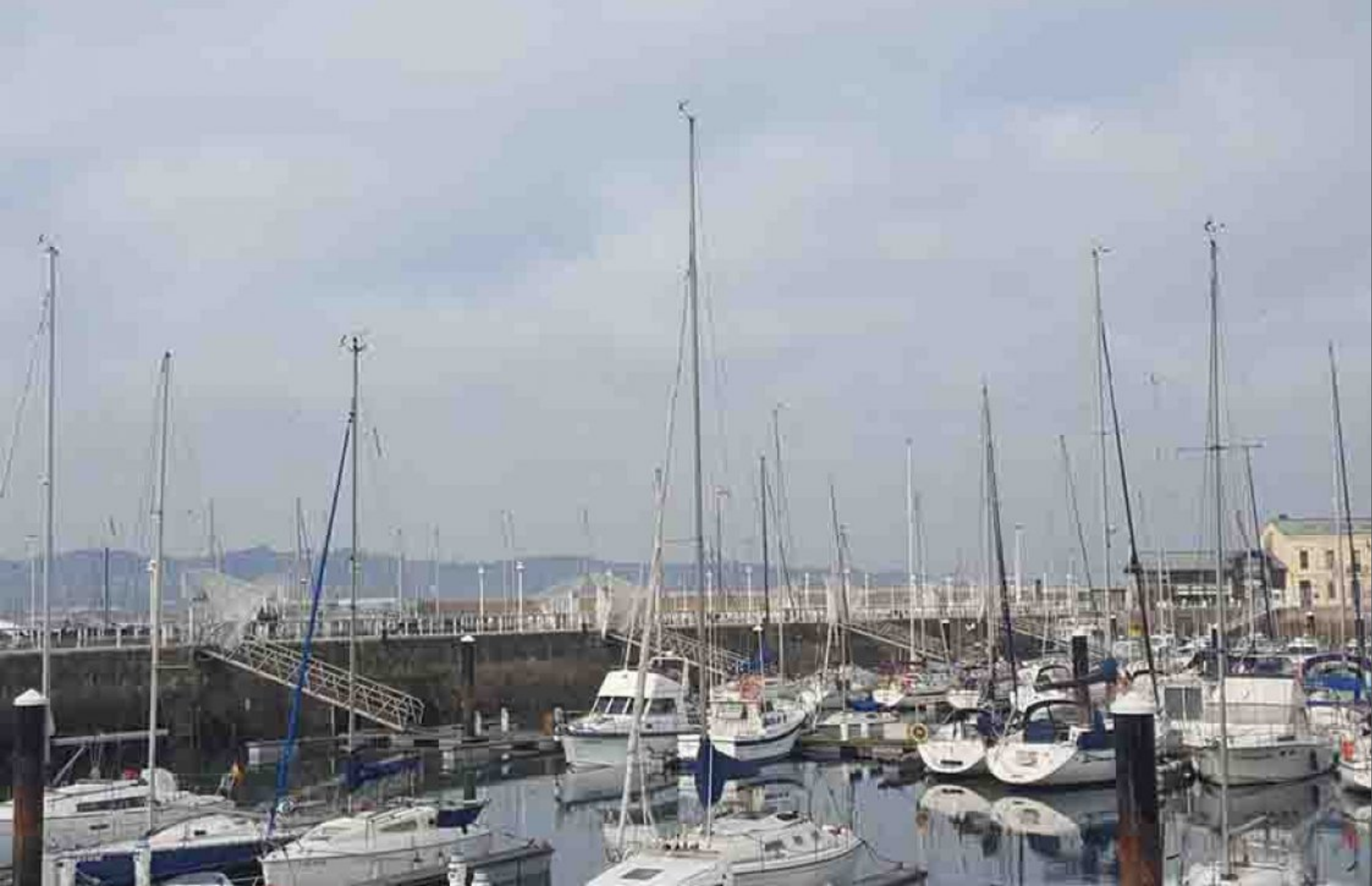
Parador de Gijón Surroundings