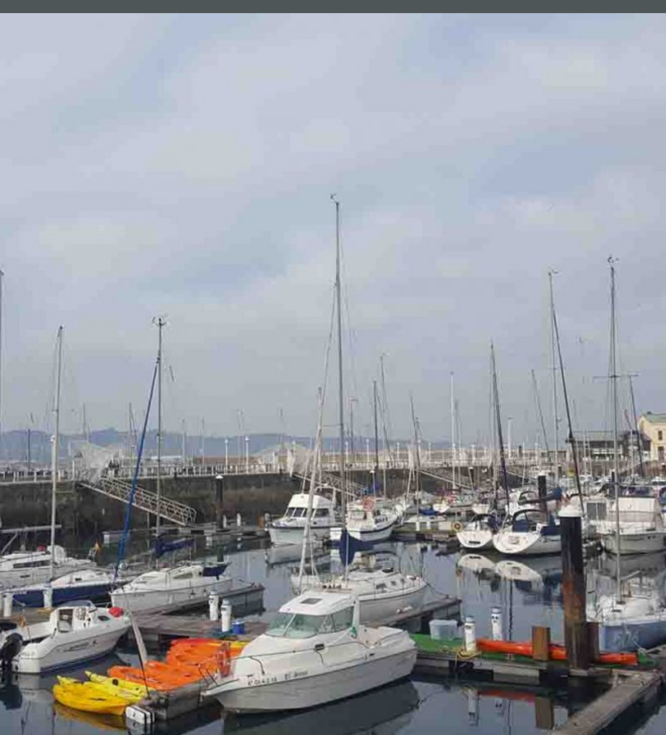
Parador de Gijón Surroundings