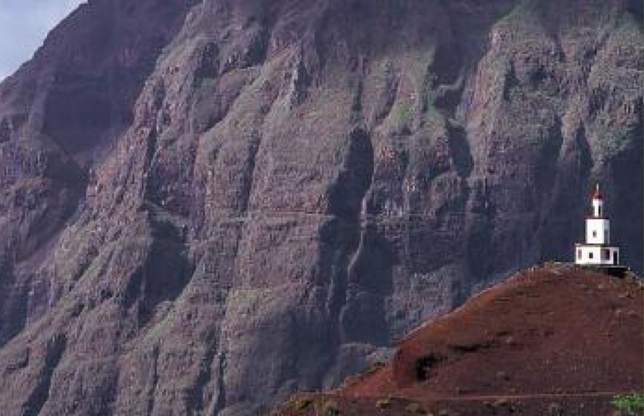
Parador de El Hierro Surroundings