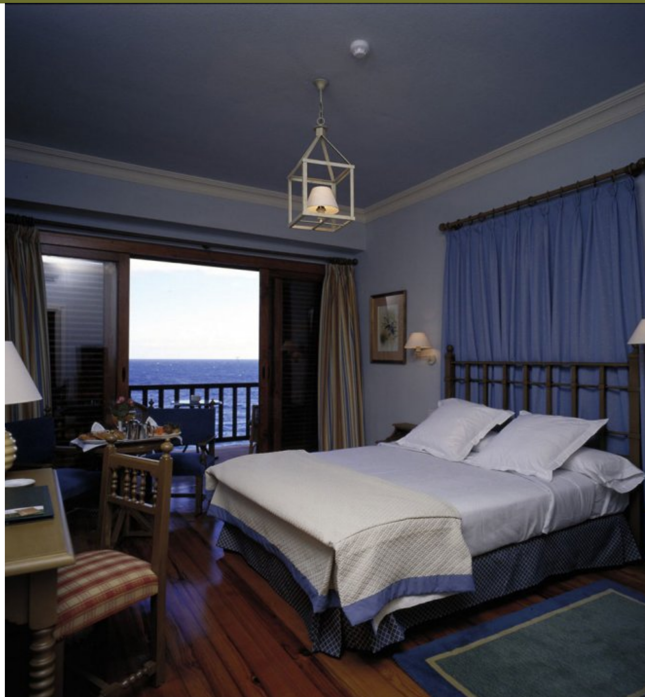
Parador de El Hierro Rooms