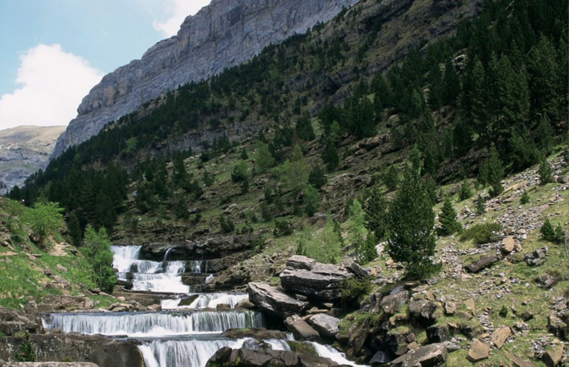
Parador de Bielsa Surroundings