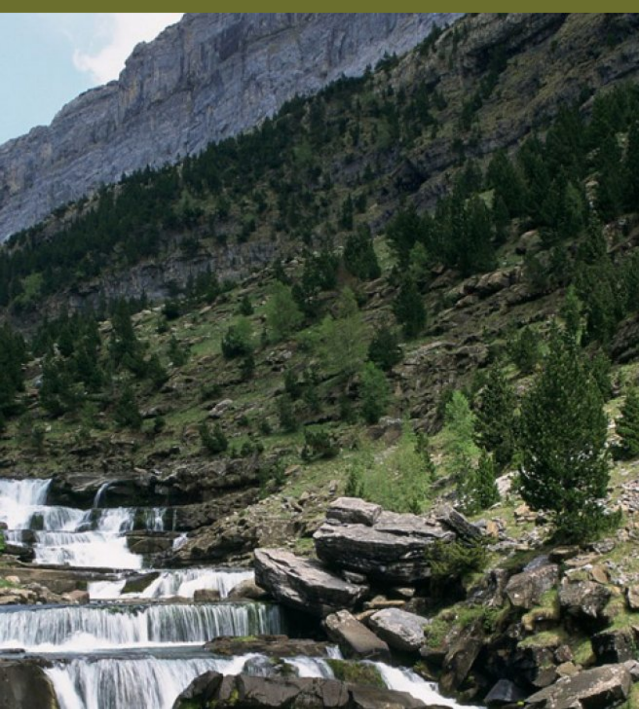
Parador de Bielsa Surroundings