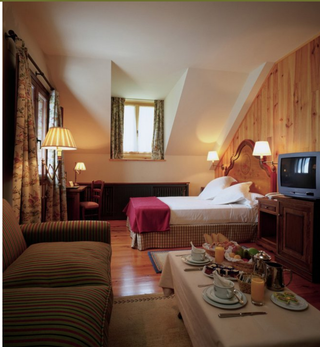
Parador de Bielsa Rooms

Here, each season of the year paints a different canvas: green, gold, red, white ... all of them equally spectacular, none of them forgettable. Postcard perfect views will remain in your mind's eye, along with pleasant memories of the Parador de Bielsa.