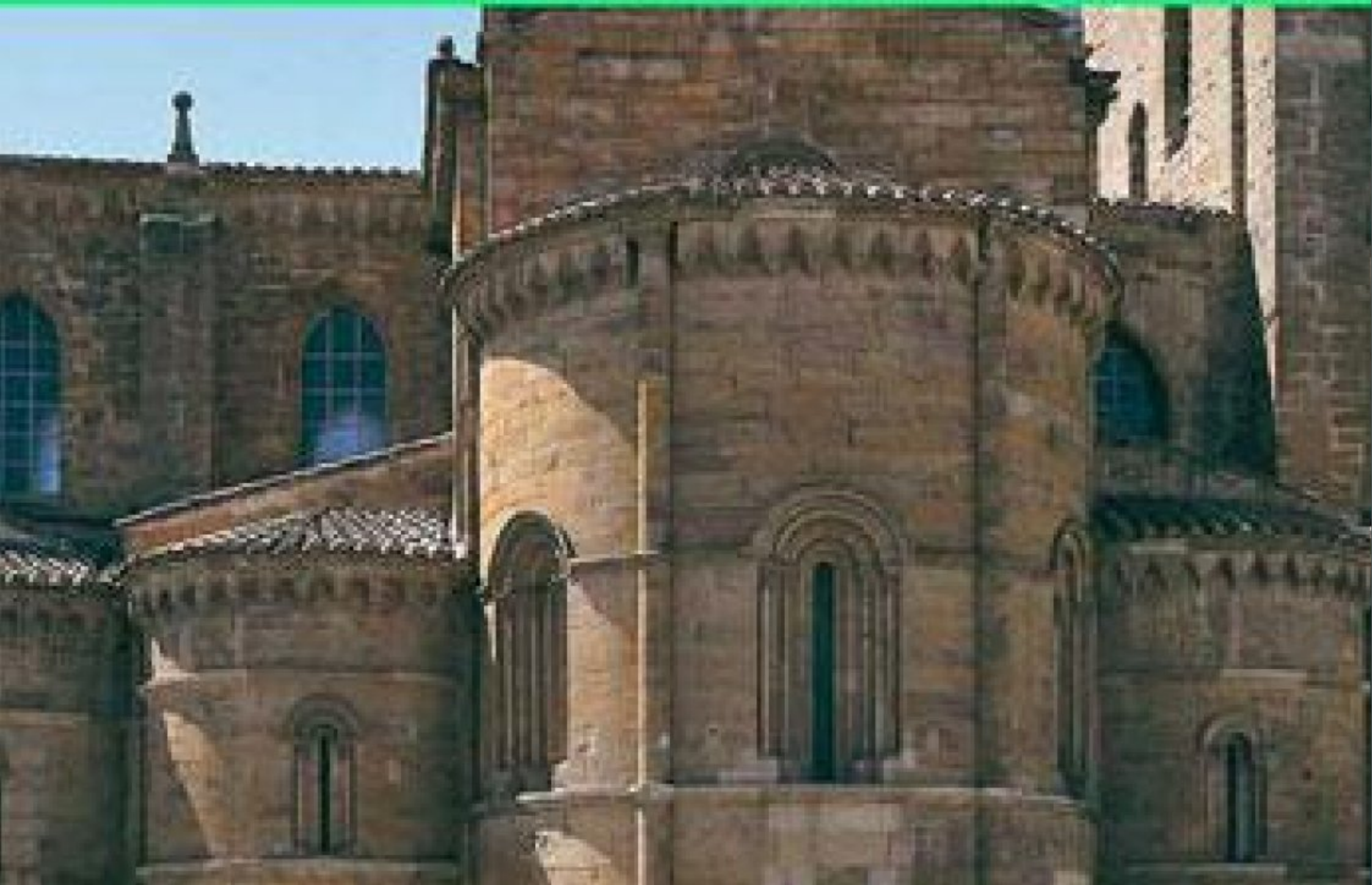
Parador de Benavente Surroundings