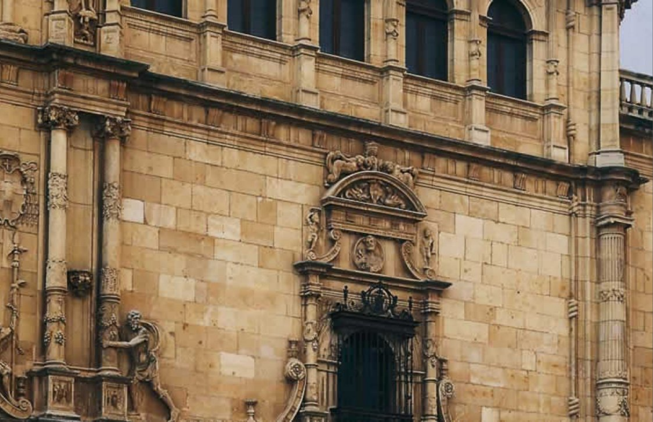
Parador de Alcalá de Henares Surroundings