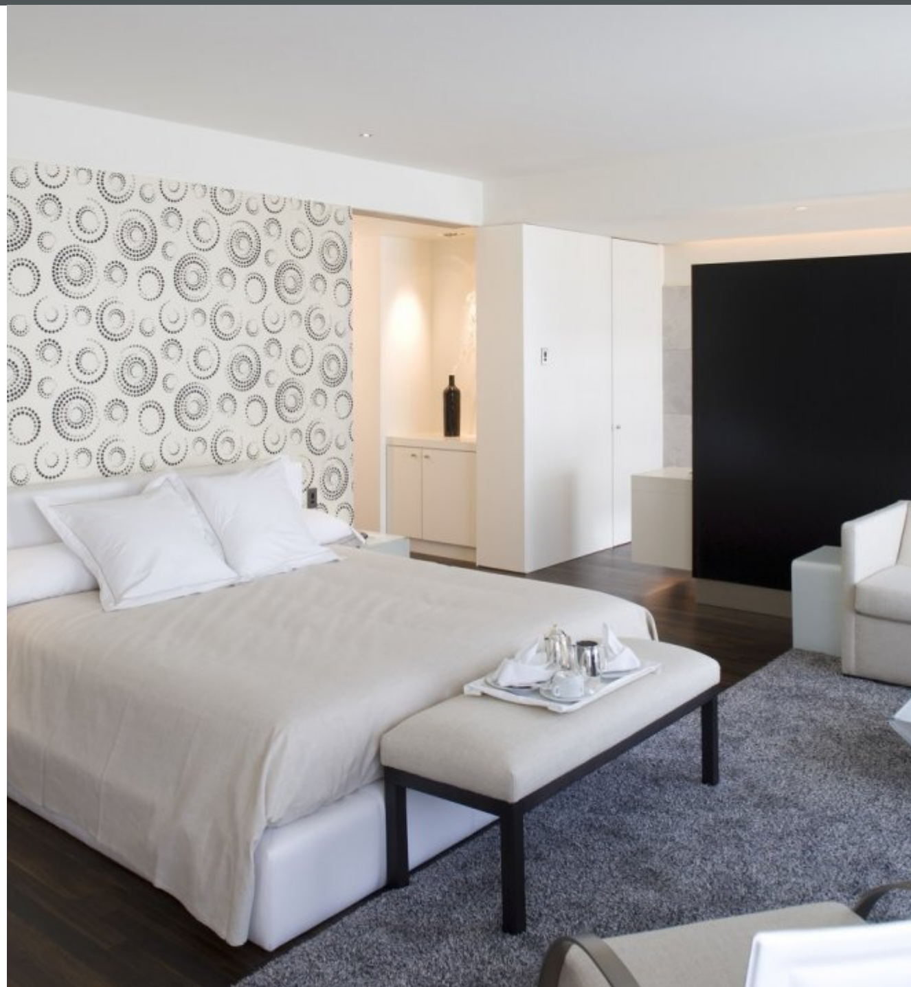
Parador de Alcalá de Henares Rooms