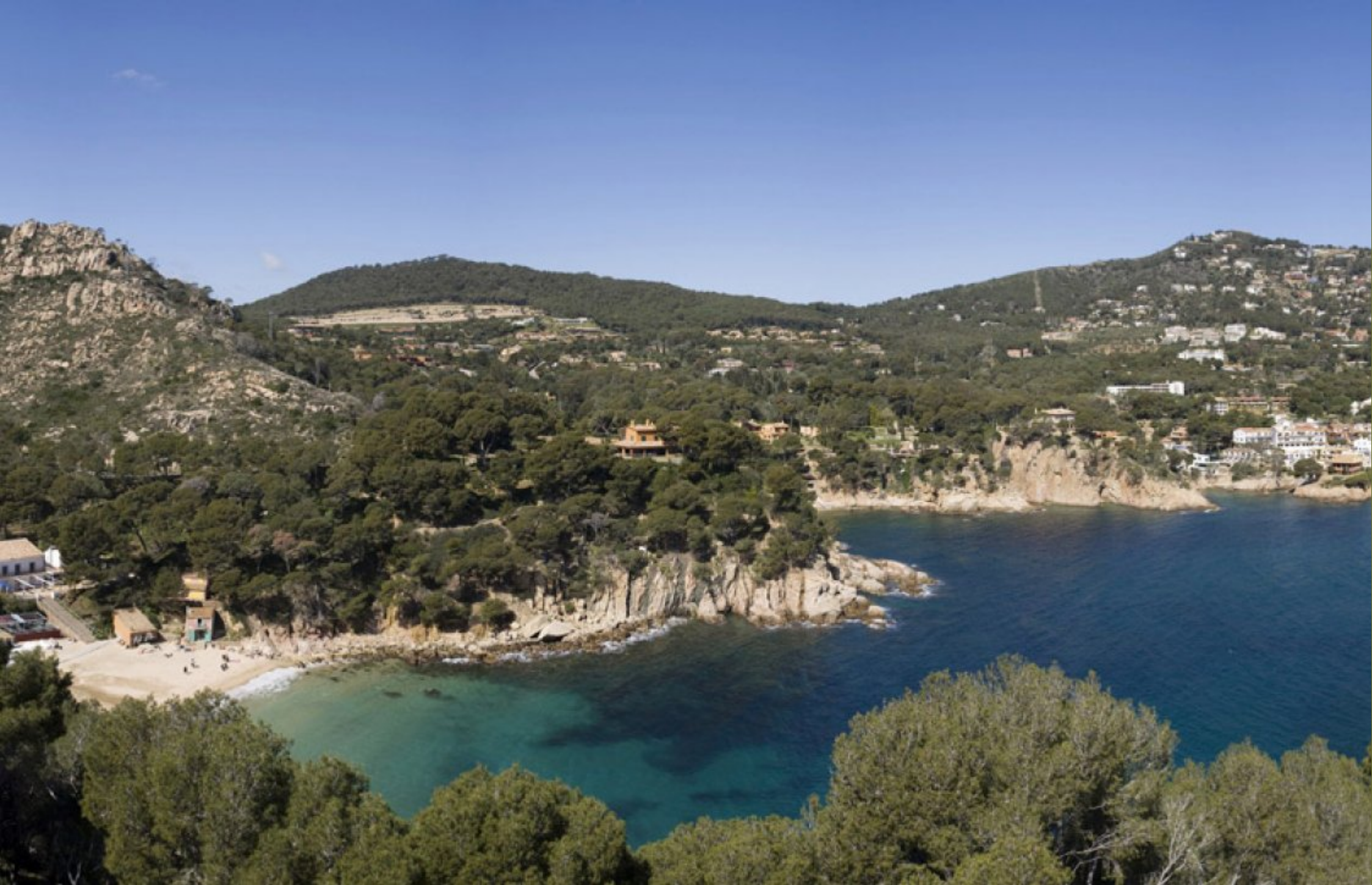
Parador de Aiguablava Surroundings