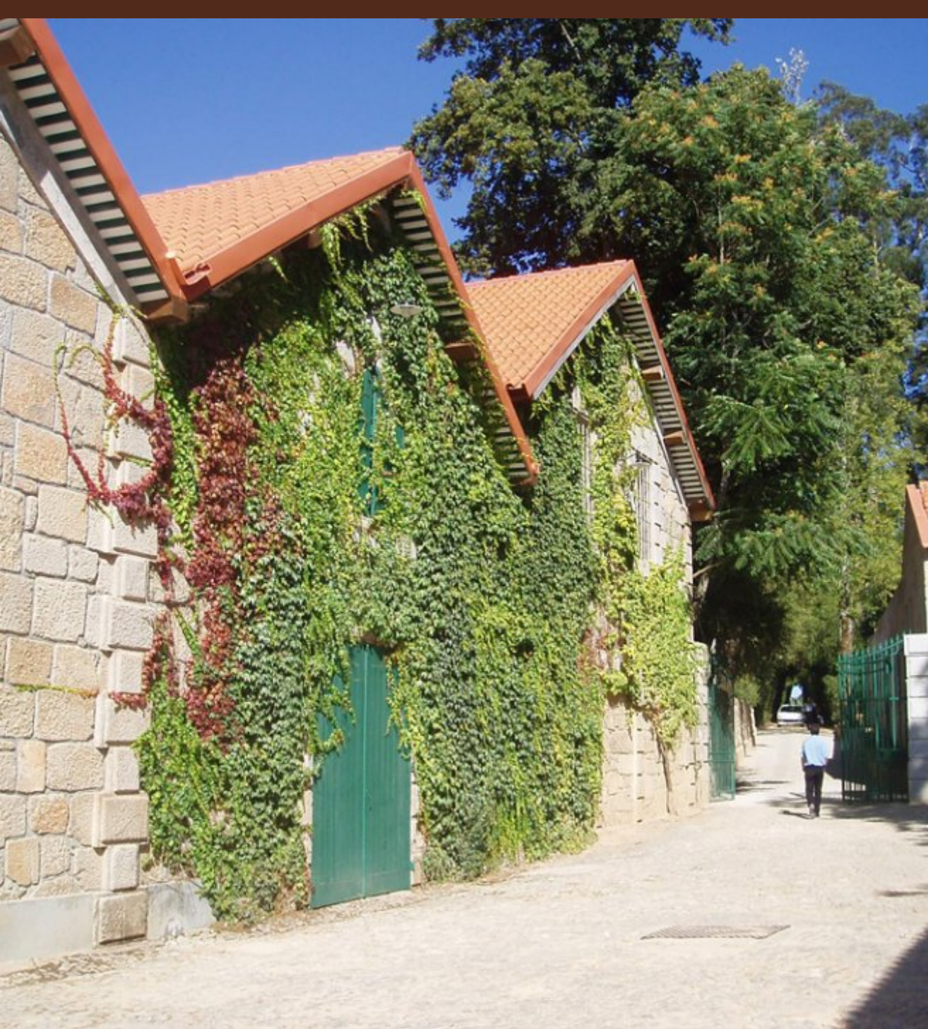
Parador Casa da Ínsua (Portugal) Surroundings