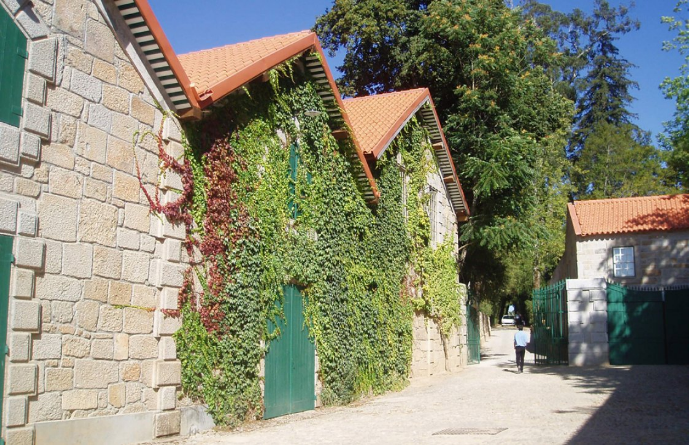
Parador Casa da Ínsua (Portugal) Surroundings